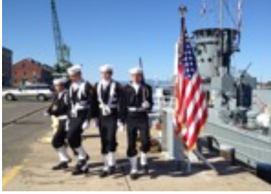
Photo: US Naval Sea Cadets Pyro Division Color Guard Lost Boats Memorial October 2013

9:30am – 3:30pm Come Aboard USS LCS 102 WWII Landing Craft Support Gunboat