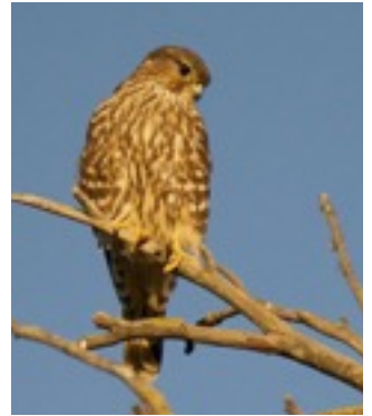
merlin, north Mare Island

Saturday, Feb 14 10:00am, 11:00am, 1:00pm and 2:00pm and Sunday, February 15 10:00am, 11:00am, 12noon and 1:00pm.