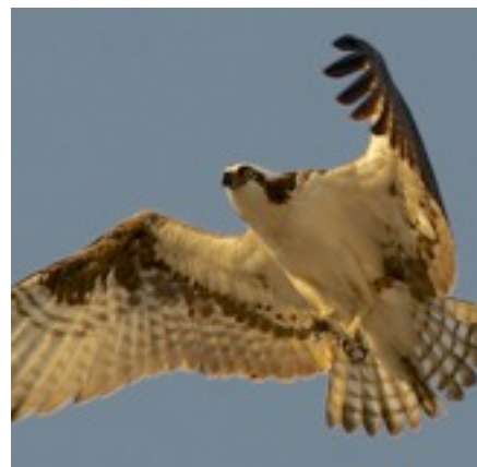
osprey middle Napa River