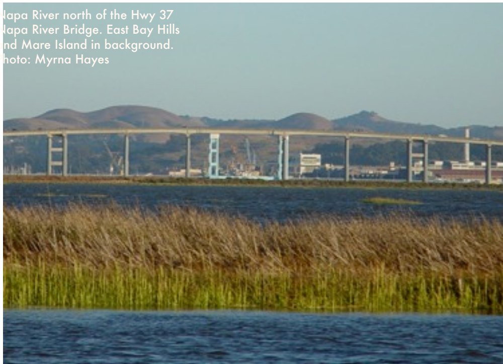
Napa River north of the Hwy 37 Napa River Bridge. East Bay Hills and Mare Island in background.